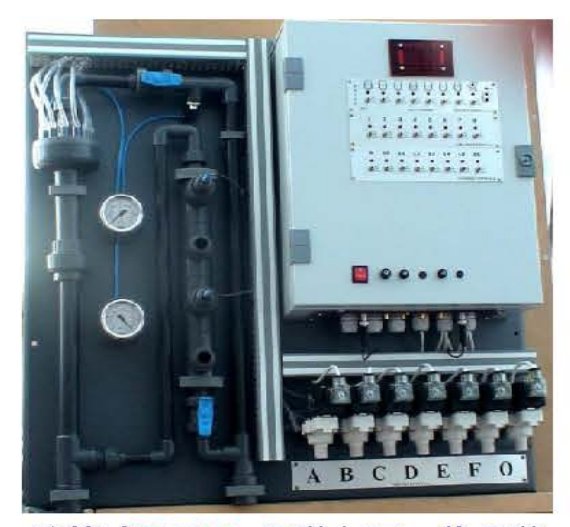
壁挂式CAUA-6 型水肥一体化营 养液自动调控装备 Wall-mounted integrated water and fertilizer automatic control equipment