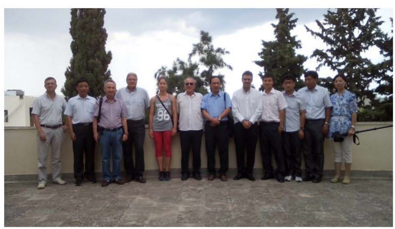
Workshop ending memorial photo